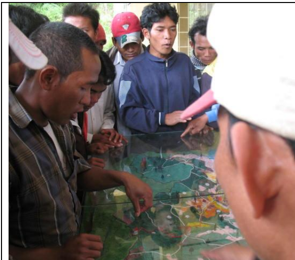
Discussion and sharing the local knowldeges