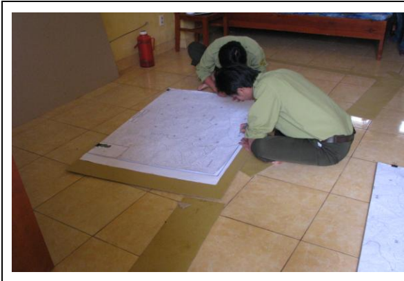
Construct a background map