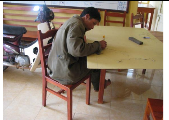
Cut the contour lines