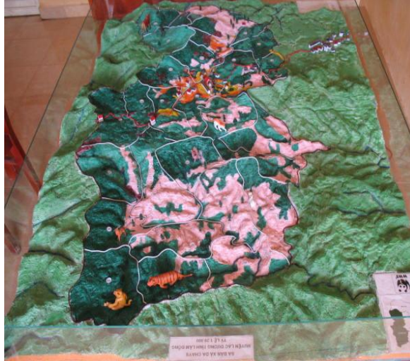
A Completed model