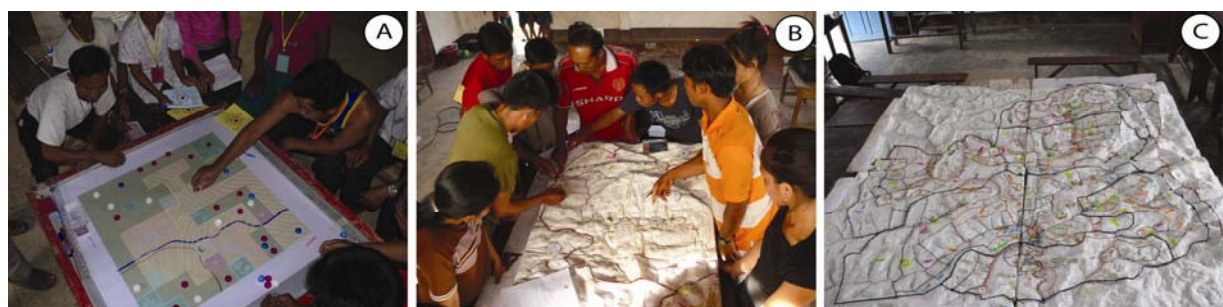
Fig. 2. Boundary objects support interactions between people and landscapes. (A) Virtual landscape used to simulate land use planning. (B) 3D modeling facilitates villagers’ comprehension and participation. (C) The resulting land use zoning in Muongmuay kumban (see also Fig. 1C).

Finally, during a meeting with the village cluster representatives, the boundaries of all villages were reviewed and finalized using maps. Fig. 1B displays the result of the delineation process validated by the local authority. After ensuring that no potential territorial conflicts were left pending, inter-village boundary agreements forms were issued to all villages and approved by the district administration.