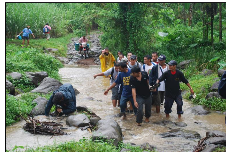
Fig. 2. Evacuation drills conducted in Yubo, Philippines, in June 2011.