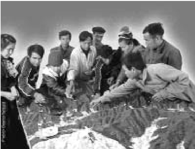
Photo 2: Discovery learning, the first step for informed decision making