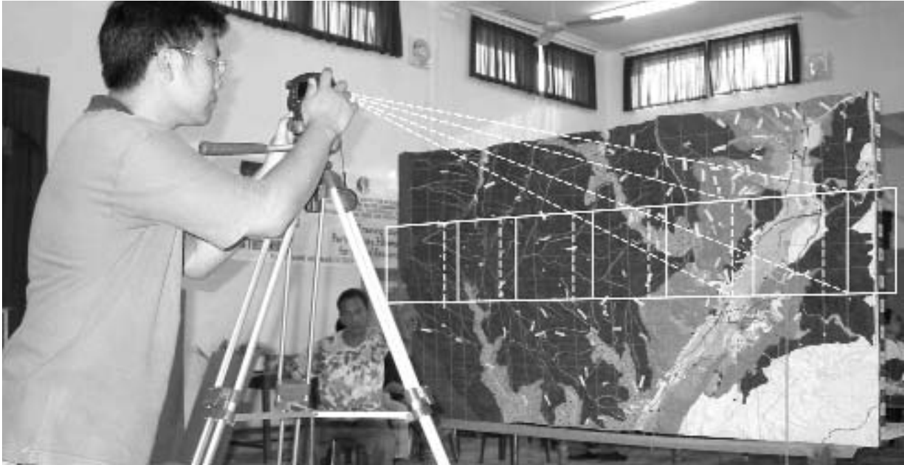
Photo 7: Parallel camera movement shooting to capture digital, high resolution images of the landscape