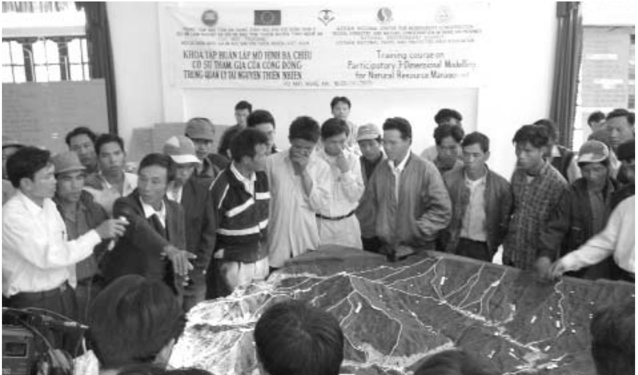
Photo 6: Villagers introducing a second group of key informants to the dynamics of the exercise