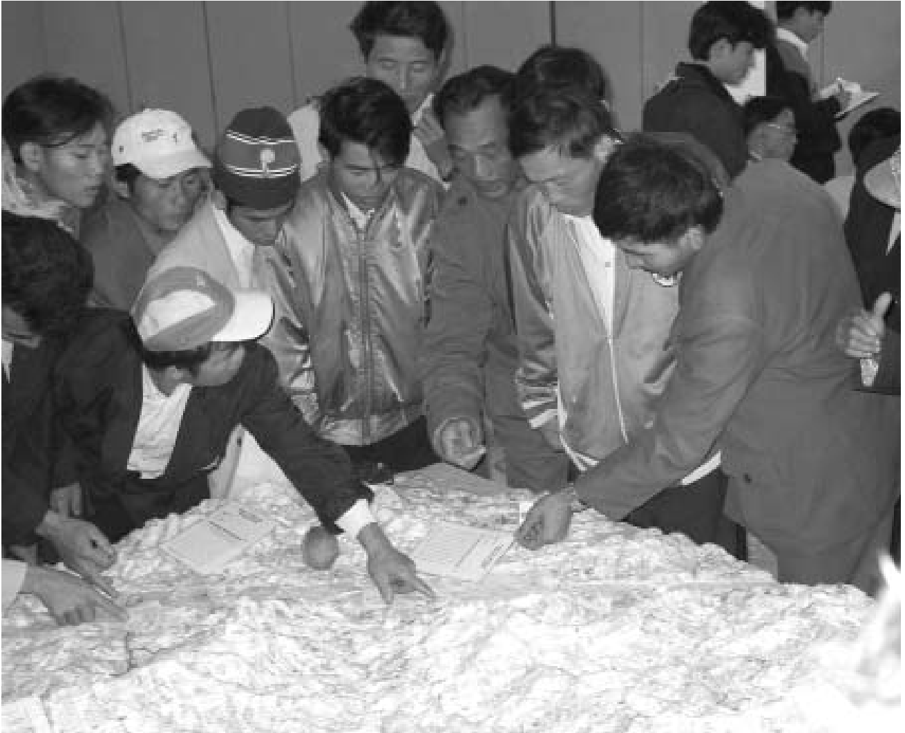
Photo 4: Key informants locating themselves vis-à-vis the relief model

The 1:10,000-scale model, measuring 2.8m x 2.4m, covers a total area of 70,000ha including portions of core area and buffer zones located southeast of the park. A 1:7500-vertical scale was used to enhance the perception of slope.