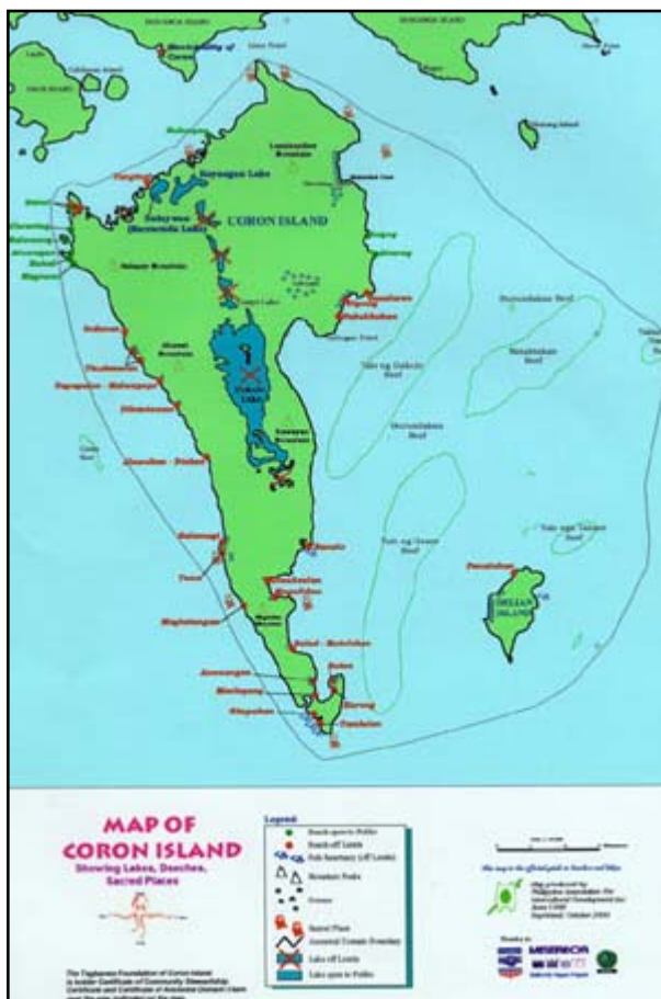
Figure 1: Section of Tagbanua map from the Philippines showing the island of Coron with a chain of large lakes in the central mountains. Symbols mark sacred reefs, fish sanctuaries, protected swift zones, and protected mangroves under Tagbanua customary law. The darkest line is the edge of their Ancestral Waters.

with frequent cloud cover. The government of Panama, for example, recognised the community-based maps of the Darien as the most accurate maps of that part of the country. This success strengthened community confidence in contesting government decisions. Maps of traditional resource ownership borders are being used in Botswana to contest the imposition of new administrative borders that cut through traditionally defined zones linked to local institutions that conserve those resources (Hitchcock 1996).