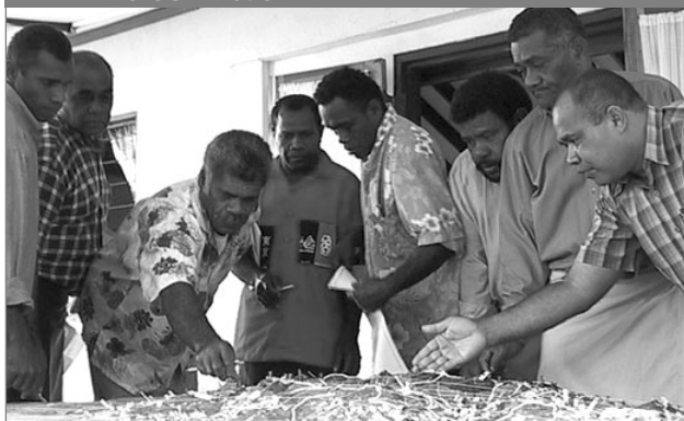
Figure 4: Mental transect walk along the landscape of the 3D model