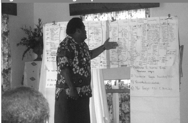
Figure 5: Transect diagram presentation

Each group nominated a highly knowledgeable elder as leader, and one documenter. Using the 3D model as a visual and tactile reference, each group selected its transect itinerary. Using a wooden stick (Figure 4), leaders mimicked the walk, pointing at and naming different habitats and relevant species found there, and describing their status, opportunities and threats. The groups discussed the findings until they reached consensus. This was noted down by the documenter on the transect diagram (Figure 5). All 12 groups went