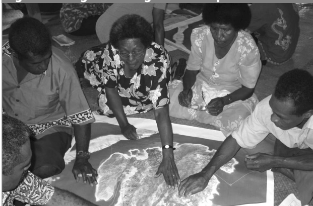
Figure 2: Villagers working on an orthophoto

In September 2004, the Ministry of Tourism, the Beqa Island Tourism Council, the University of the South Pacific (USP) and the Native Land Trust Board (NLTB) assisted the residents of the island in initiating a participatory process. This was aimed at developing a Qoliqoli Management Plan. 2 The two-day