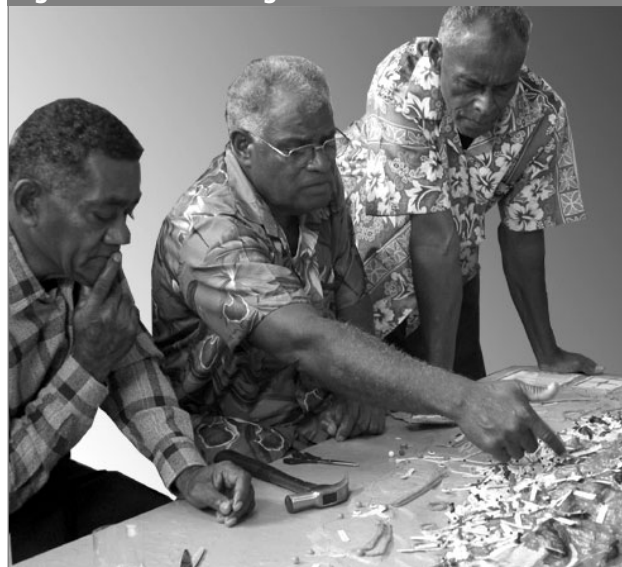
Figure 3: Elders working on the model

But those involved in data extraction said the process was difficult. It involved three people: the first person looked at the orthophoto map. The second person identified corresponding features from the legend. The third person was responsible for on-screen digitising, matching individual features sketched on the maps with landmarks identified on the digital geo-referenced orthophoto map. They had to try to accurately reproduce both the size and location of these features. Features that were found to be overlapping on different annotated orthophoto- and/or qoliqoli maps were selectively digitised. Discrepancies were noted down, ready to be raised at the follow-up workshop. This was where the verification of all captured data would have been done.