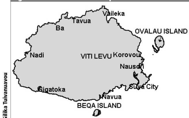
Figure 1: Where Ovalau and Beqa Islands are located