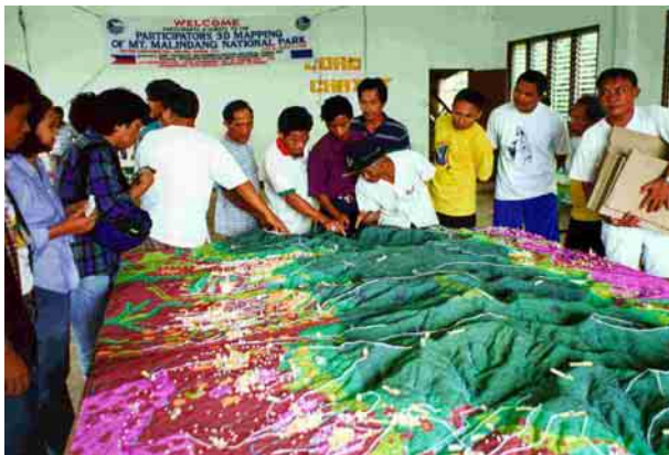
Figure 4 1:10,000-scale relief model of Mt. Malindang National Park and environs

On January 4, 2001 the Philippine Department of Environment and Natural Resources institutionalized Participatory 3-D Modeling by virtue of Memorandum Circular No. 1, S. 2001 as a process to be adopted in protected area planning and management.