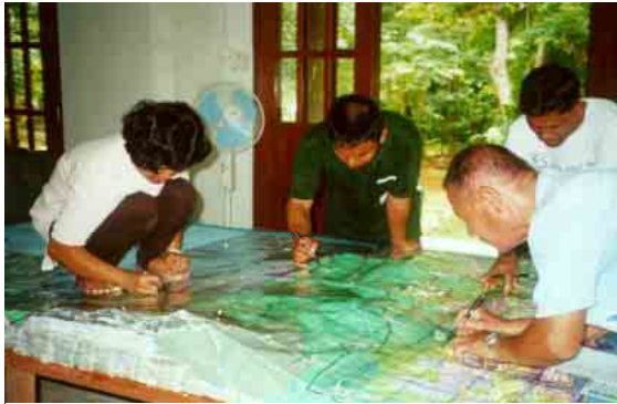
Figure 3 Information is extracted

In order to use the 3-D model for Participatory M&E or for combining thematic layers of different sources, the information has to be extracted and stored. In practice, whatever is displayed on the model is transferred to transparent, grid-referenced plastic sheets (Figure 3) in the form of points, lines and polygons. Attributes (non-graphic information like names, descriptions of land use or cover) are consigned to a legend. Plastic sheets and accompanying notes are handed over to the GIS, which digitizes, stores and edits