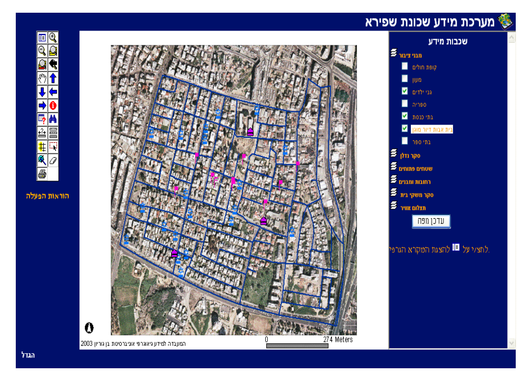
Figure 2: PPGIS on the WEB system.

The system is built on a website with no spatial data (presentations, maps, data), and the GIS web system on the web (based on ARCIMS tools). The site enables the public to participate in the process, everywhere and anytime. It enables viewing extensive amount of GIS-based data from surveys, and statistical analysis on the internet. The data include: Arial photographs geographic information layers such as: neighborhood buildings, business offices, homes, public buildings, open areas, streets, etc. The site contains presentations of various subjects. In addition, the public is able to respond and comment to the planning team and to get an update of the PP with the help of the online awareness billboard. The site address is: http://shapira.bgu.ac.il (Hebrew), Figure 2 present print screen of the PPGIS on the WEB system.