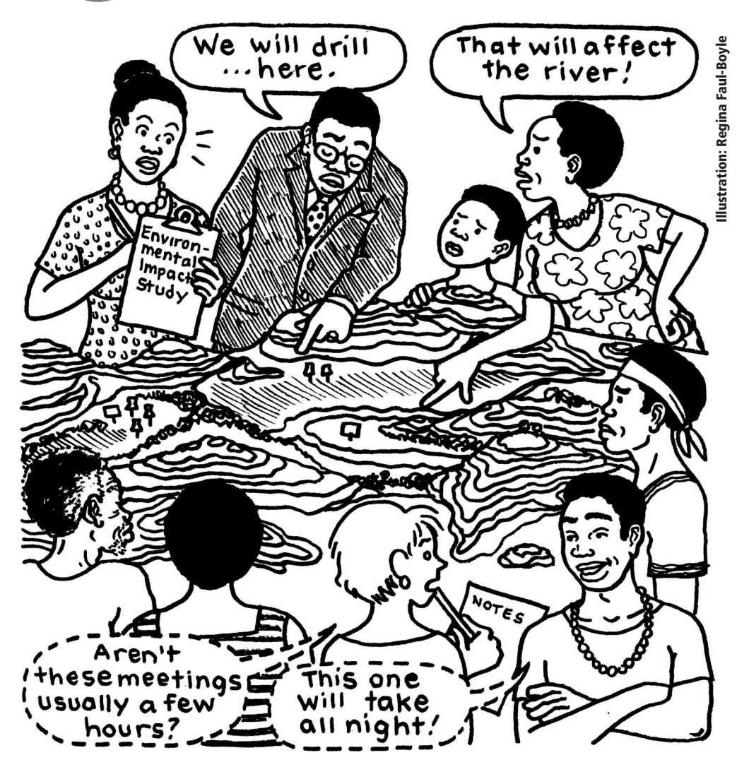
While presenting a report on a proposed mining project, external environmental impact assessment experts were surprised by the community's detailed engagement in the discussions.

public hearing. They have done it in other villages but with different reactions. They normally only have to spend a couple of hours there, but in our village they had to stay overnight (Ringo Kodosiku, 2012, personal communication).