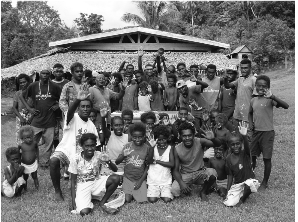
Chivoko's villagers gather around the completed P3DM model.

project activities were directed by the community with a clear reference to the discussions around the model, supported by other participatory activities. Villagers became actors while outsiders were catalysts and co-learners. Many other internal activities and decisions are still assisted by the model, and conversations with villagers confirm their sense of continued community ownership.