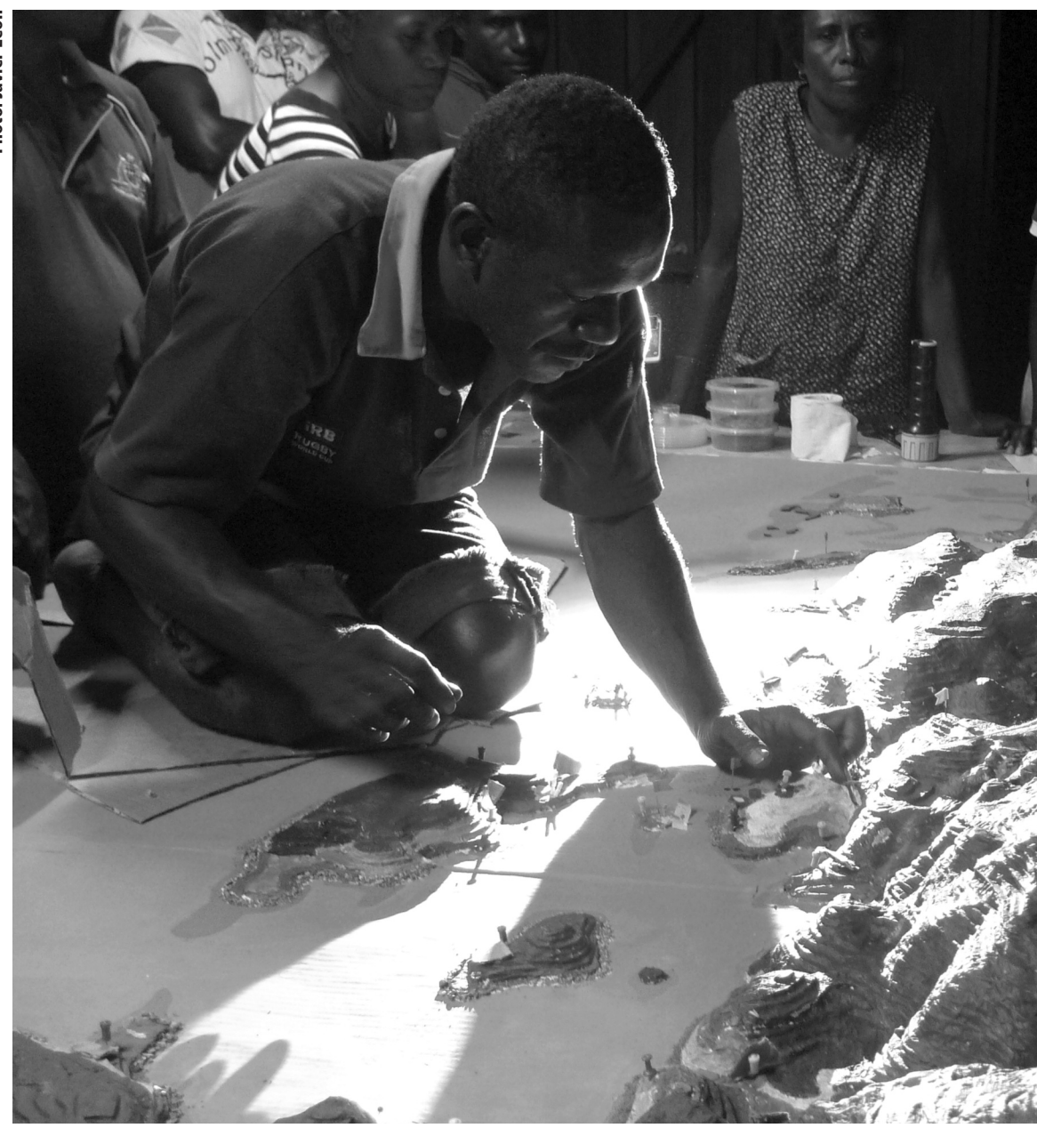
Finalising the three-dimensional model in Boe Boe.

tsunami (Javier Leon, personal communication 2011). There was an open discussion around the participatory 3D model, comparing the DEM scenarios to actual experiences of high tides and storm events. In some instances, the community challenged the DEM scenarios, identifying the presence of near-shore rocks, an