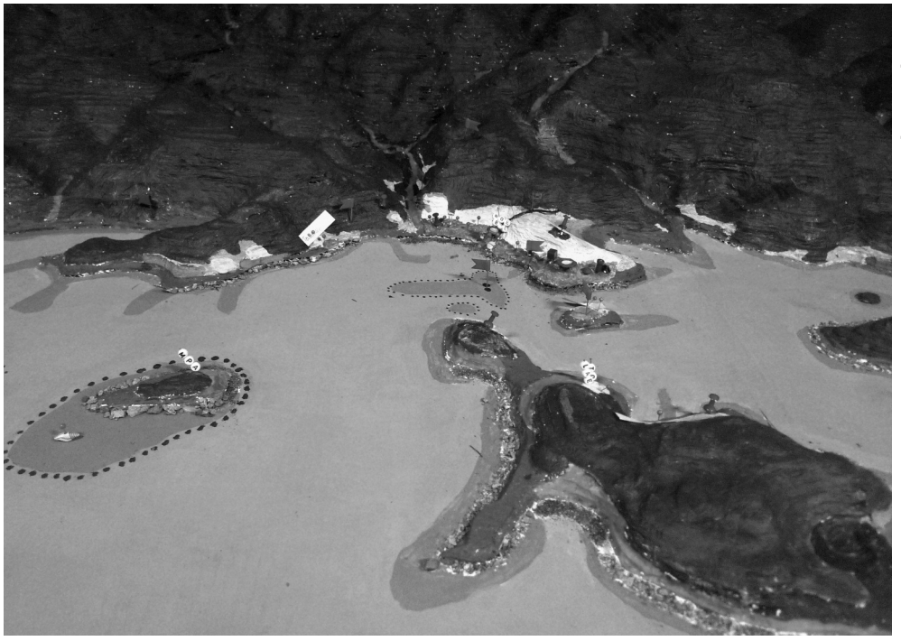
Coastal landscape and marine protected areas on the Boe Boe participatory 3D model.

trespassing on marine and terrestrial protected area boundaries was common since their extent was not precisely known. Visualising the small terrestrial protected area in Boe Boe also provided evidence that it needed enlarging. In both cases, participants discussed the reasons underpinning conservation and the conditions under which this status could be suspended.