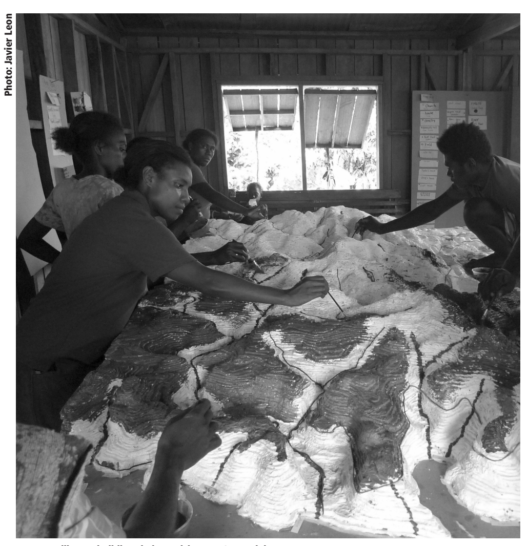
Boe Boe villagers building their participatory 3D model.