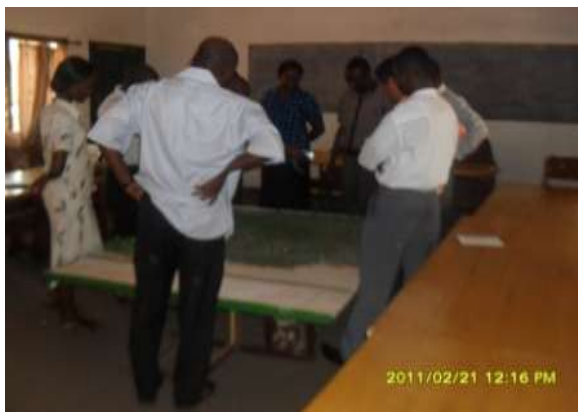
Figure 3: Stakeholder Dialogue

After the completion of the map, it was presented to both regional and district staff of Ministry of Food and Agriculture (MoFA) in the Northern Region, MoFA collaborators [Japan International Cooperation Agency- JICA, German International Cooperation -GIZ, Engineers Without Borders -EWB, Agence Française de Developpement –AFD, Northern Rural Growth Project), ProNet (NGO in Upper West Region of Ghana), Voluntary Service Overseas- VSO staff and volunteers, Environmental Protection Agency, National Disaster Management Organisation, United Nations Development Programme- UNDP and Mennonite Economic Development Association which was on an exploratory visit to Northern Ghana to identify suitable avenues to support food security in the region.