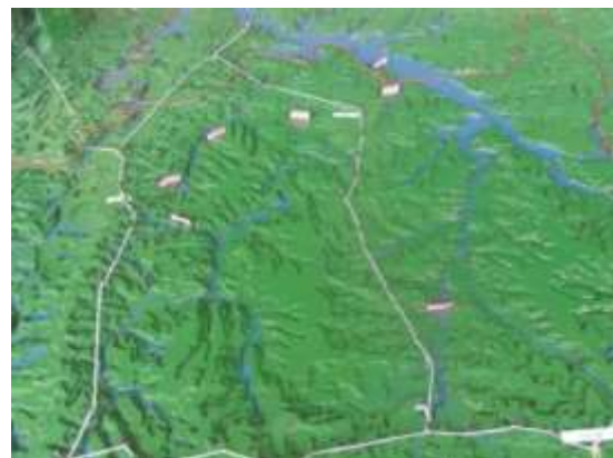
Figure 4: Landmarks of Selected Lowlands for the Rice Sector Support Project