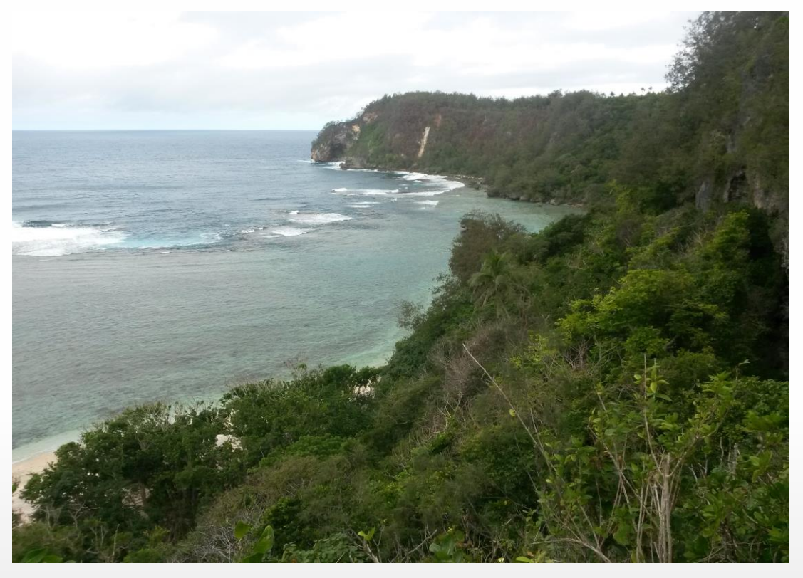
Evaluation Office of UN Environment June 2017