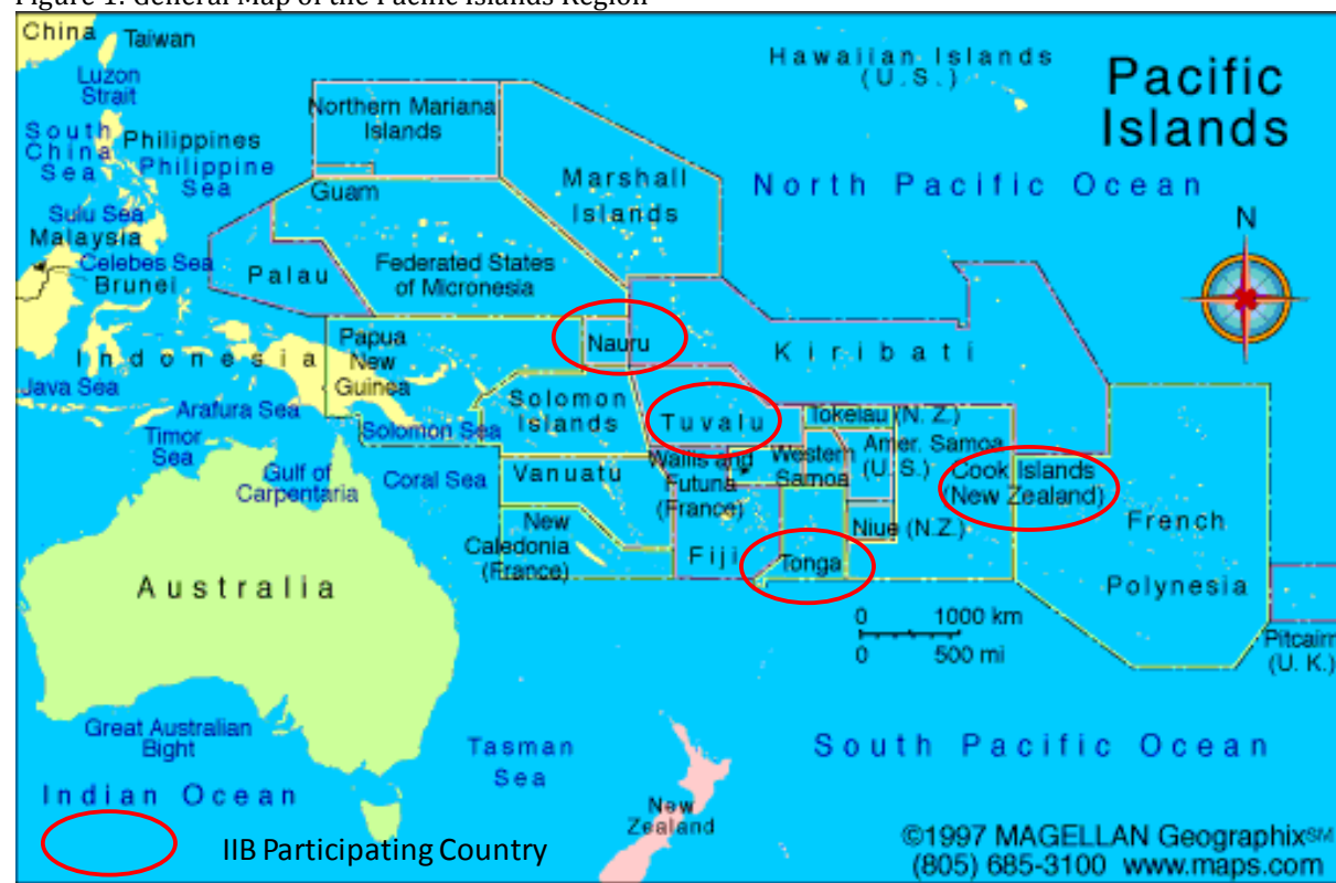
Figure 1: General Map of the Pacific Islands Region