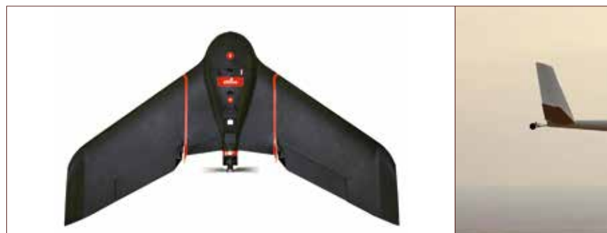
Figure 2: Examples of fixed wing UAVs

There are two main types of fixed wing UAVs: the flying wing (Figure 2, left) and the more traditional airplane configuration (Figure 2, right). Fixed wings need considerably more space for take-off and landing compared to multirotors. However, because of their improved flight dynamics, they can cover much larger areas making them ideal for applications such as surveillance, land surveys and large-scale agricultural activities.