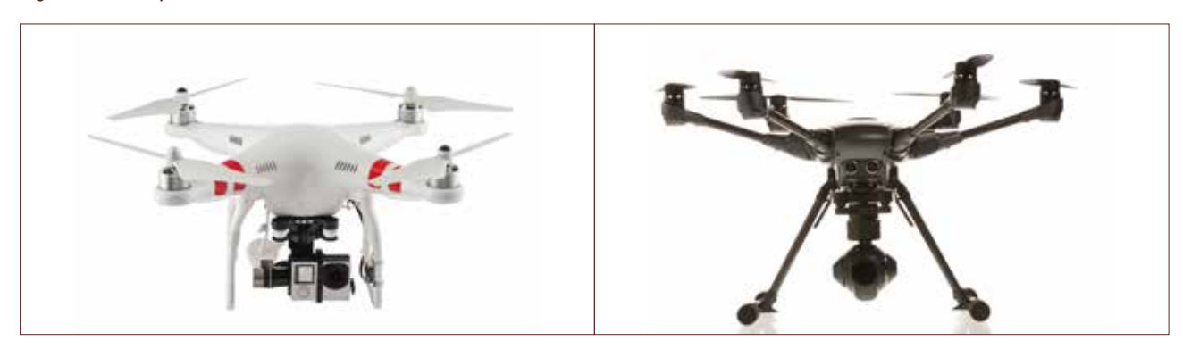
Figure 1: Examples of multirotor UAVs

Multirotor UAVs (Figure 1) are currently the most popular drone type and are defined as a UAV that uses three or more blades to achieve lift and movement. Companies like DJI¹ and Parrot² have been able to commoditize the multirotor type drones, forcing down the price and thus removing the cost barrier to using UAVs. The simple rotor mechanics utilized by these UAVs have greatly reduced the complexity associated with piloting such craft. With better flight control, multirotor aerial vehicles have been extensively used in applications such as aerial photography and site inspections. One key advantage that multirotors have over fixed wing UAVs is that they have vertical take-off and landing meaning they need very little space to be deployed.