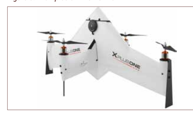
Figure 3: Examples of VTOL UAVs

VTOL, or hybrid drones, are a much more recent innovation and take advantage of the multirotor ability for vertical take-off and landing (Figure 3).